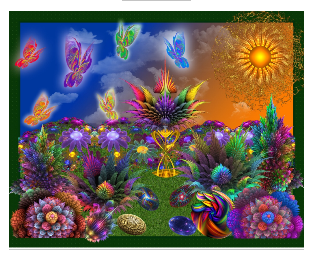
"Fairy God-Mother's Water-Wise, Mini-Butterfly Garden: Xeriscaping the Future of Pollination, from Planning to Planting" LAB ACTIVITY: