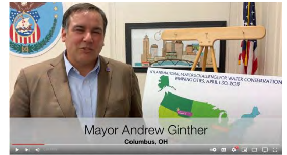
Columbus Mayor Andy Ginther Urges Residents To Join in Wyland National Water Conservation Campaign